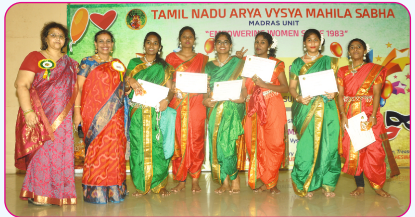
Group Folk Dance Winners - SKP College Students