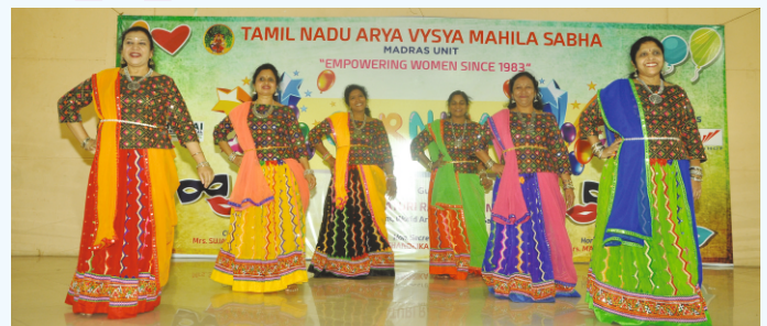
Mahilas including Chairperson and Past Chairperson performing a Folk Dance