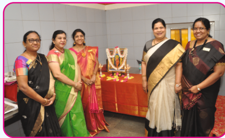
Seeking blessing from Goddess Vasavi