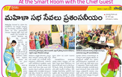
In the News

TNAVMS Madras Unit has contributed brand new 50 Desks, 50 Benches, 10 Teachers Tables and 25 Revolving Chairs (used), 3 Toilets were renovated, 20 LED Tube lights and 11 Wall mount fans and Sports equipment for all Sports for the Children of Poppili Raja Higher Secondary School, Puzhal on 31st January 2020. It was the collective contribution of so many Donors and members which made it possible of Mahila Sabha to accomplish this task