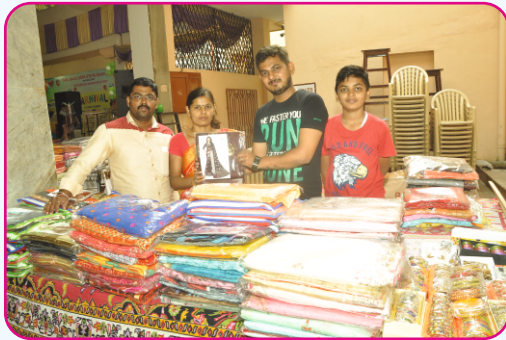
Display of Handicrafts by a Woman Entrepreneur

Kumkum to a bride. Two Women writers were appreciated and honored during the day.