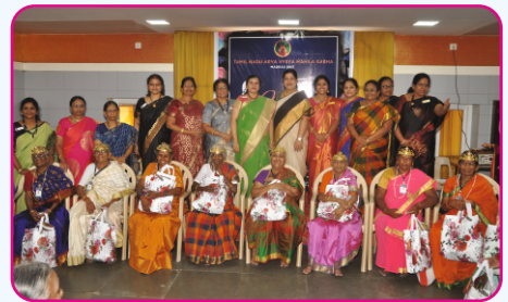
Distribution of Goodies to 60 Inmates of Akshaya Trust