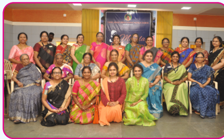
One Great big moment captured for Life