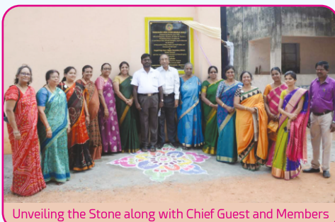
Unveiling the Stone along with Chief Guest and Members