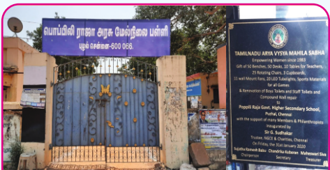
Poppili Raja School & Happy and overwhelmed to present the plaque