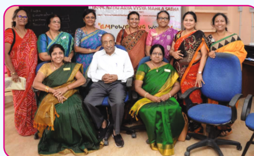
At the Smart Room with the Chief Guest