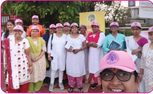
Mahilas at Besant Nagar Beach to promote All round Safety for women