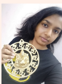
3rd Prize :