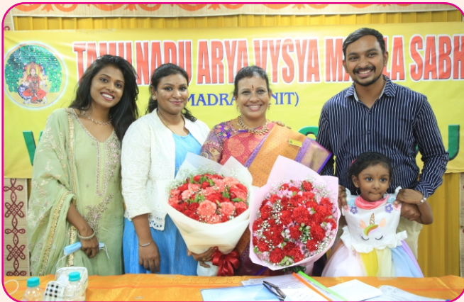
Felicitation from Chairperson's Family members