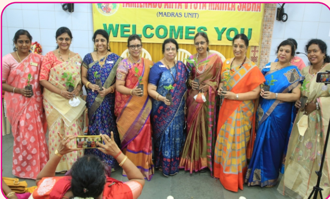
Go Green project was started by distributing tree saplings