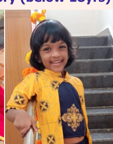
2nd Prize :