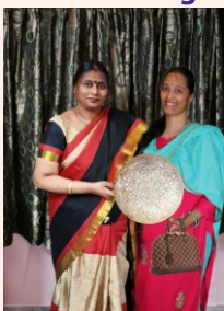
1st Prize :

Children Category (below 18yrs) the winners are: