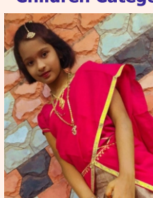
1st Prize :