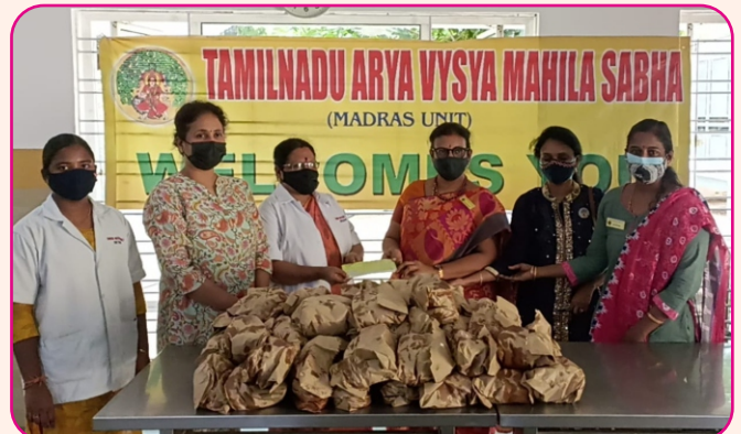
Bread donation project