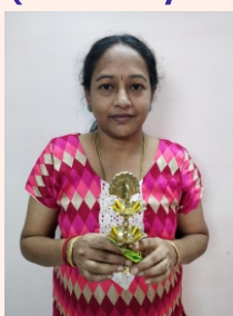
2nd Prize :