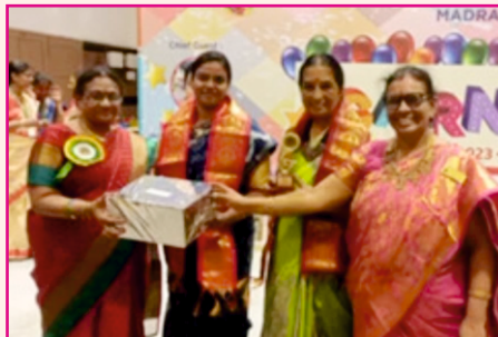
Mandala Colouring Competition