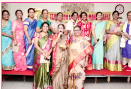
Skit by Committee Members