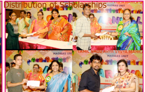
Scholarship to Students