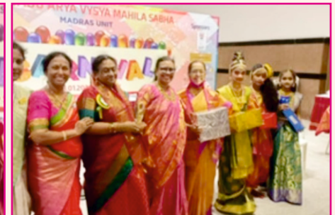
PS 1 Fancy dress Competition