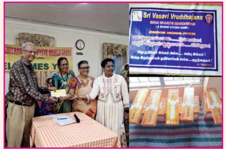
Donating Needy Items to SRI VASAVI VRUDDHAJANA Senior Citizen home in Sholingur