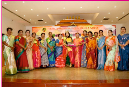
Honouring the Chief Guest